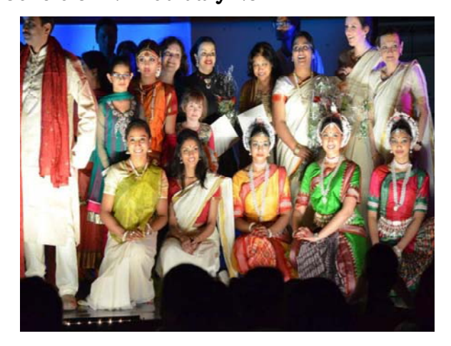
'Prerna' an open stage programme aimed at inspiring and motivating talented dance artists on 22 February 2014